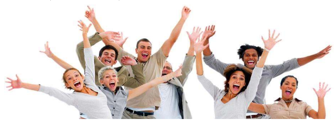
Diligence should be a way of life.

"For God is not unrighteous to forget your work and labour of love, which ye have shewed toward his name, in that ye have ministered to the saints, and do minister." (Hebrews 6:10)