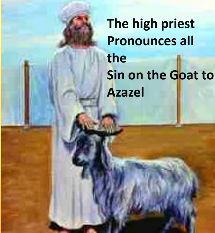
The high priest Pronounces all the Sin on the Goat to Azazel