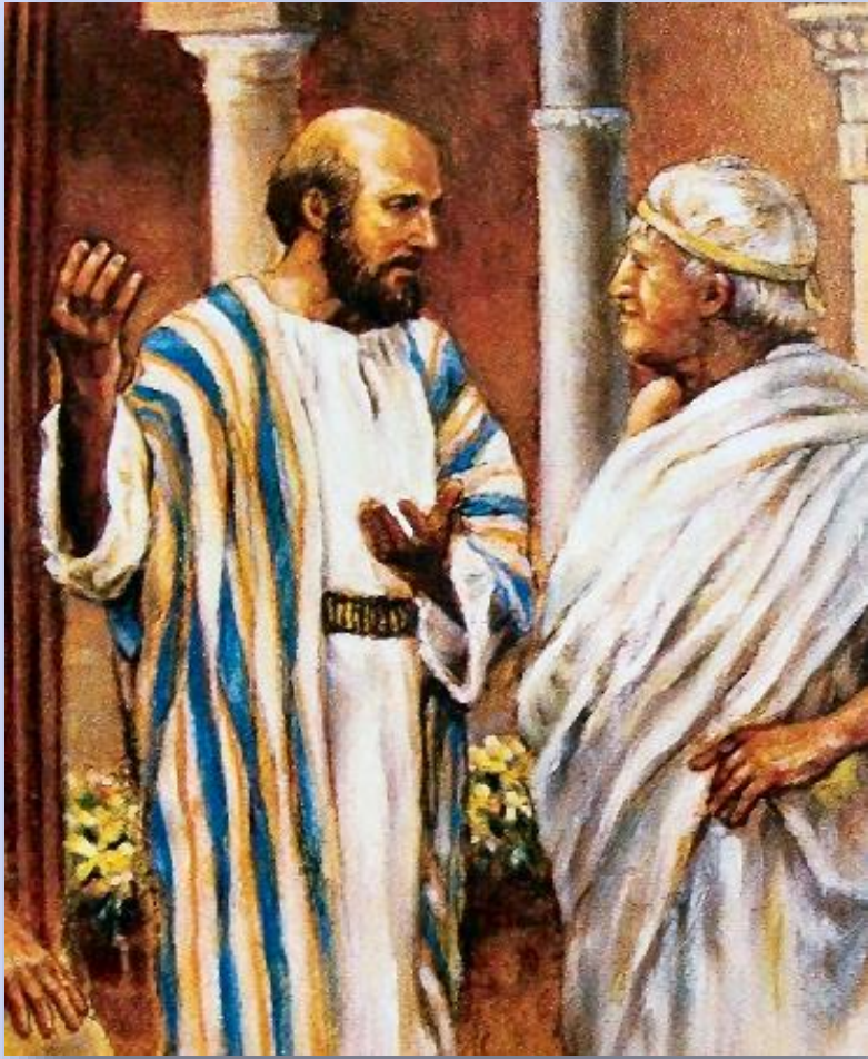
The apostle Paul