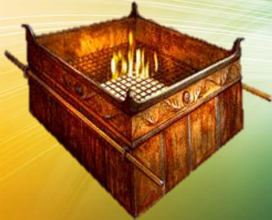
The Brazen Altar: The place of Judgment

2 Chronicles 29:22 So they killed the bullocks, and the priests received the blood, and sprinkled it on the altar: likewise, when they had killed the rams, they sprinkled the blood upon the altar: they killed also the lambs, and they sprinkled the blood upon the altar.