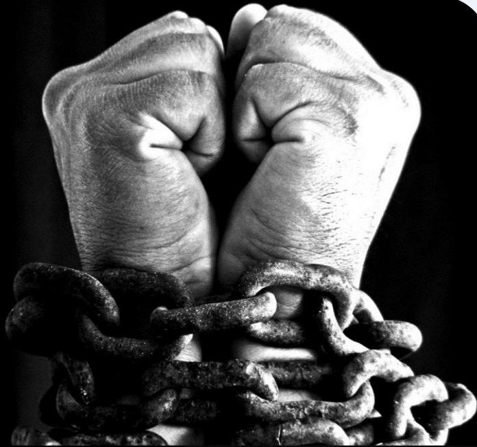
BINDING THE STRONGMAN

Matthew 18:18 Verily I say unto you, Whatsoever ye shall bind on earth shall be bound in heaven: and whatsoever ye shall loose on earth shall be loosed in heaven.