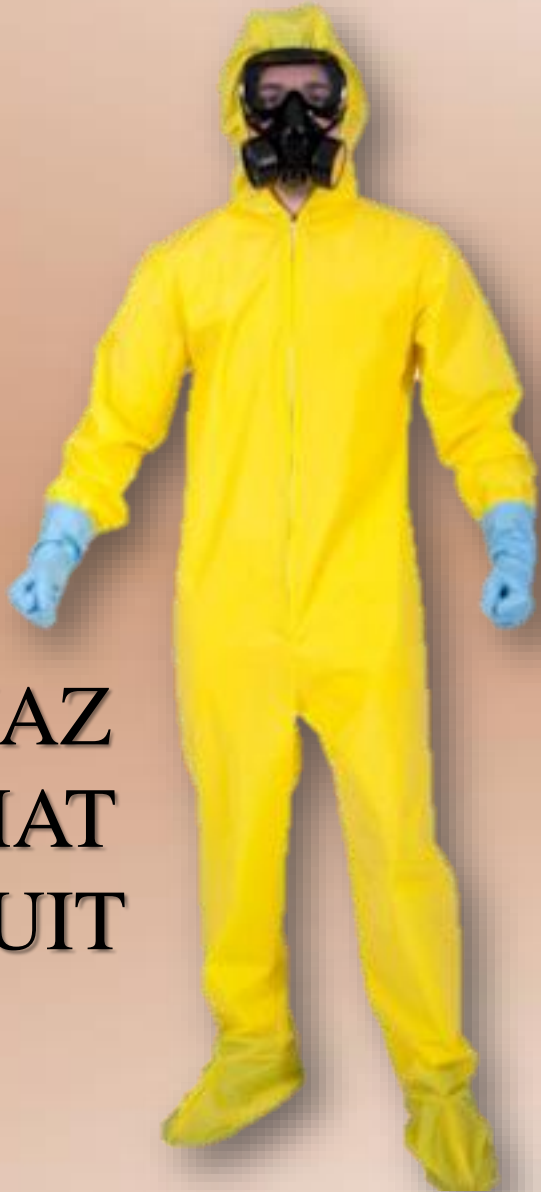
HAZ MAT SUIT

Ephesians 6:14 Stand therefore, having your loins girt about with truth , and having on the breastplate of righteousness ;