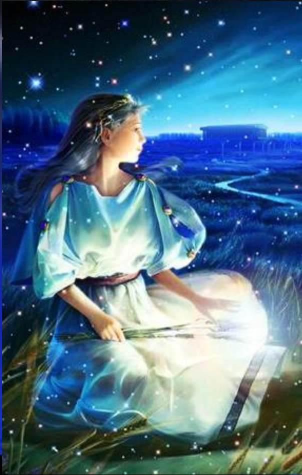
The Constellation Virgo: The Virgin