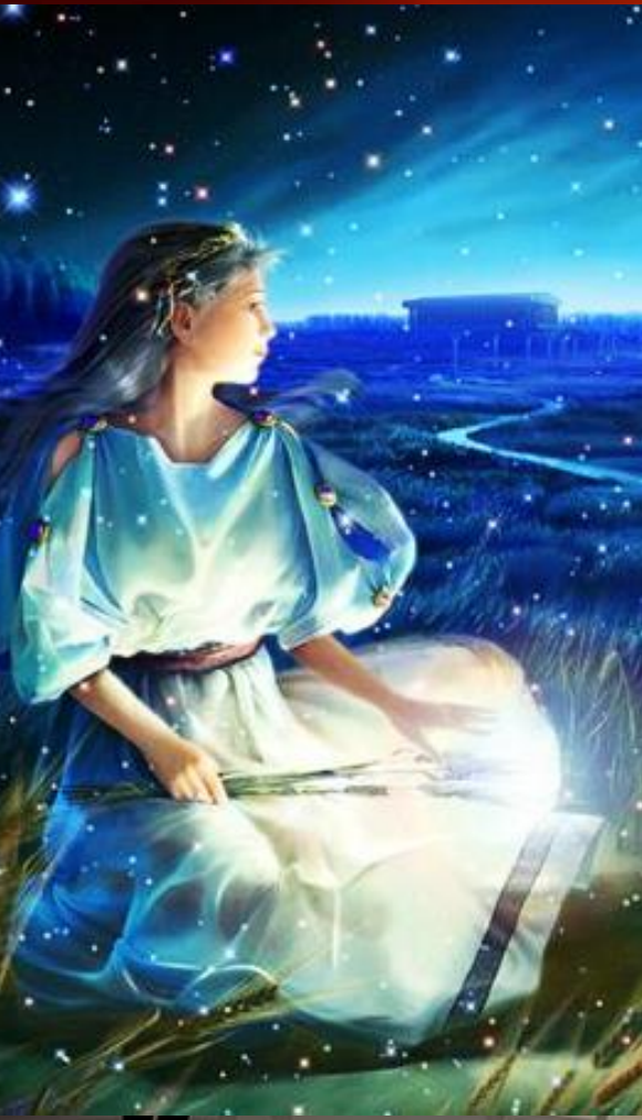
The Constellation Virgo: The Virgin