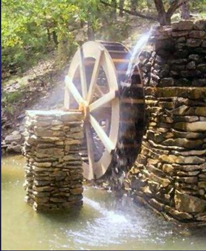
The Law of Gravity