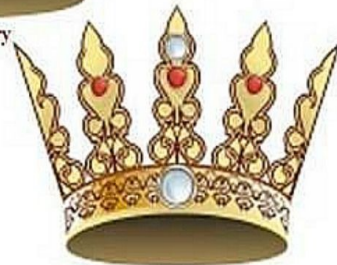
The Crown of Rejoicing (1 Thessalonians 2:19)