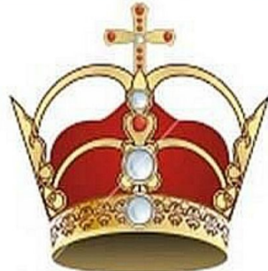
The Crown of Life (James 1:12; Rev. 2:10)