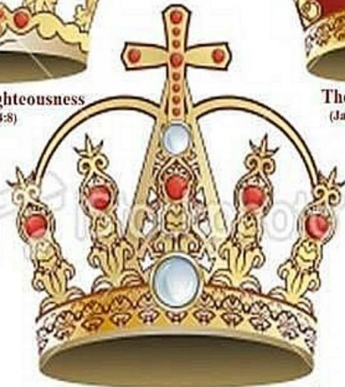
The Crown of Glory (1 Peter 5:4)