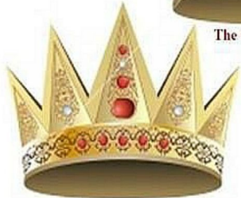
The Incorruptible Crown (1 Corinthians 9:25)