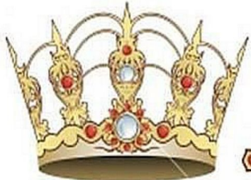
The Crown of Righteousness (2 Timothy 4:8)