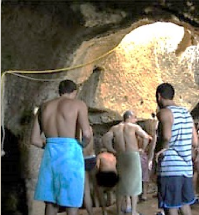
Orthodox Jews lineup to immerse themselves in natural spring water at a cave in the Jerusalem hills in a purification ritual, Mikvah (Immersion/Baptism)

Exodus 29:4 And Aaron and his sons thou shalt bring unto the door of the tabernacle of the congregation, and shalt wash them with water.